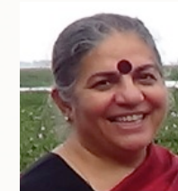
Dr. Vandana Shiva Navdanya